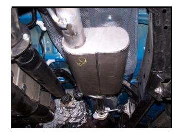
3. Install muffler #B onto head pipe 1½"-2" with the louvers facing towards the converter. Use a jack stand to support the muffler. Use clamp #E to secure the muffler to the headpipe. DO NOT TIGHTEN.

GIBSON EXHAUST systems are designed on a factory stock vehicle. Any aftermarket products installed could increase the sound levels of this Exhaust. Make sure there is a 1" clearance from ALL rubber brake lines, shock boots, fuel lines, tires, etc to prevent heat related damage or fire.